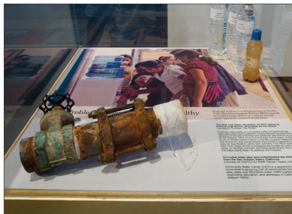
FIGURE 10. This display case, located centrally in the exhibition hall, contained a corroded water pipe and contaminated tap water samples from the San Joaquin Valley, California.

determinants of health," and "structural racism"—was unmistakable. Indeed, the exhibition was full of concrete evidence of specific instances that can be and have been described as human rights violations: