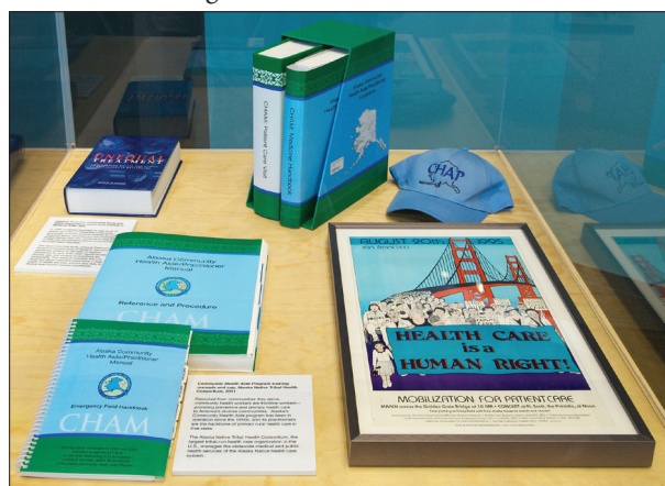
FIGURE 7. Display case showing a “Health Care Is a Human Right!” poster from a 1995 march across San Francisco’s Golden Gate Bridge.

The photographs included here cannot convey the detail, aesthetics, or multimedia dimensions of a major museum exhibition like this one. Nonetheless,