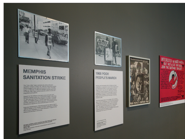
FIGURE 6. The exhibition's section on economic opportunity highlighted historical moments of collective mobilization and activist effort, including the Memphis Sanitation Strike and the Poor People's March, both in 1968.

in power toward black Americans. 25 In a 1906 passage displayed prominently in the exhibition (see Figure 5), he made the strong claim that, "With improved sanitary conditions, improved education, and better economic opportunities, the mortality of the [black] race may and probably will steadily decrease until it becomes normal." 26 While guiding