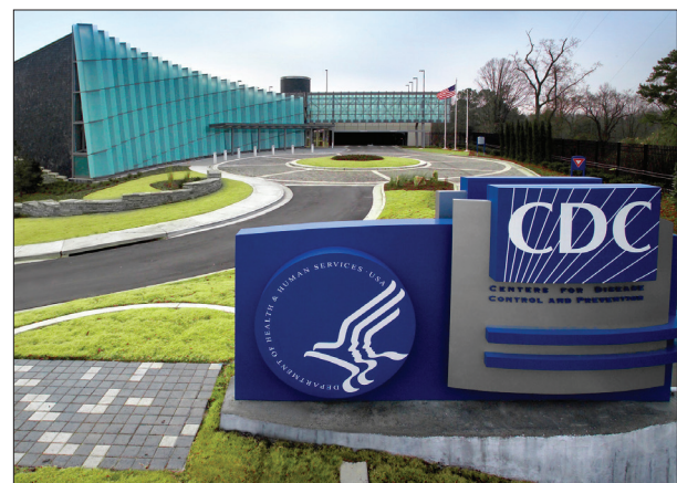
FIGURE 4. Entrance to the CDC main campus in Atlanta, Georgia. The David J. Sencer CDC Museum occupies a large section of the building on the left.

The museum is both accessible (after passing through a security checkpoint) and free to the public, and its 5,000 square-foot, two-level gallery is immediately visible to anyone arriving at the agency’s main entrance. The lower level contains a permanent exhibit about the history of CDC. The much larger, entry-level gallery hosts temporary exhibitions on topics ranging from specific diseases like cancer and Ebola, to vulnerable communities like refugees and physical laborers (in mining, fishing, agriculture, construction, and other industries), to more conceptual themes, such as the relationship between art and science. 23 Some are visiting exhibitions, while others are created at CDC, but all use museological strategies to invite reflection on issues of social, medical, scientific, and moral concern. As the curator explained to me, the museum’s estimated 95,000 visitors per