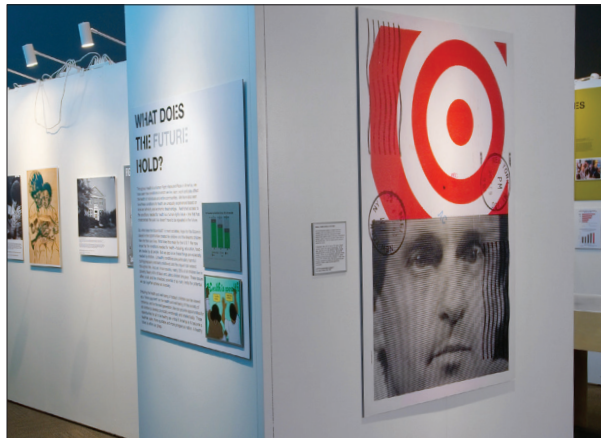
FIGURE 11. Enlarged version of the 1991 ACT UP postcard sent to James Curran, who was then serving as Director of CDC's HIV/AIDS Task Force.

ably safe and drinkable. Notably, the exhibition had been open to the public for more than six months on April 25, 2014—the date on which officials in Flint, Michigan, announced the city had switched its water supply from the city of Detroit to the Flint River, a decision that catalyzed a slow-moving catastrophe that continues to damage the city's infrastructure, economy, and residents' health. 27