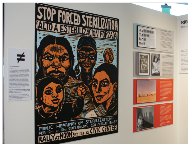
FIGURE 9. 1977 poster by Rachel Romero announcing a public hearing about the forced sterilization of Latina women.

As the curator's comments make clear, creating a museum exhibition like this one involves striking a balance between aesthetic, professional, and institutional considerations, as well as moral ones. To understand the design of the exhibition and its title, we need to keep in mind the role of the curator and the curatorial logic at play.