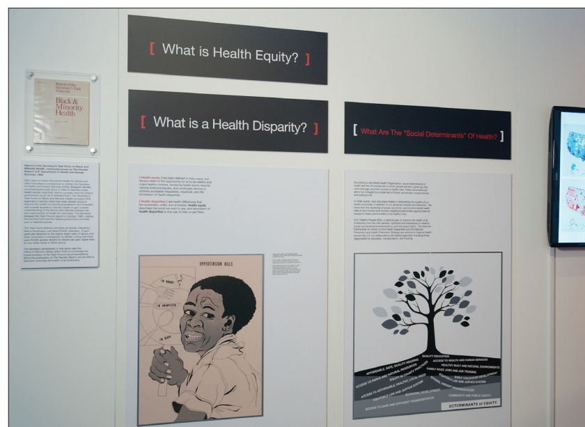
FIGURE 3. Opening panel of the “Health Is a Human Right” exhibition. The cover of the Heckler Report is displayed on the far left, accompanied by definitions of the exhibition’s core concepts (center).

I felt—passionately—that it was time to decipher the message inherent in that disparity. In order to unravel the complex picture provided by our data and experience, I established a Secretarial Task Force whose broad assignment was the comprehensive investigation of the health problems