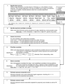
Figure 2. Flow chart for basic high-dimensional propensity score algorithm.