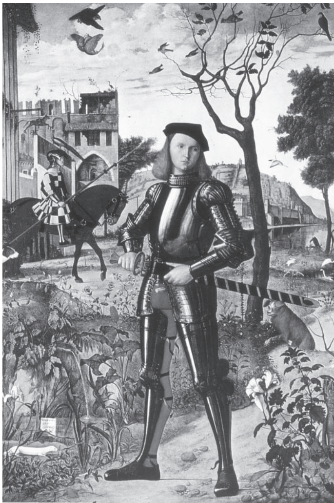
Figure 1: The 'Knight with the Ermine', probable portrait of Ferdinand II of Aragon, King of Naples (1467–96), by Vittore Carpaccio (Lugan, Thyssen Collection).