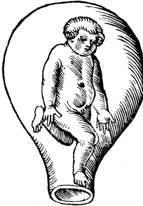
Figure 2: Depiction of a foot presentation in Rösslin's Rosegarten . Reproduced from Eucharius Rösslin, Der schwangeren Frawen und Hebammen Rosengarte [sic], [Augsburg, Heinrich Steiner, 1529], f. Ciiii verso.

addition of a new image depicting an additional pair of twins, one presenting head-first, the other feet-first. All three of the extant manuscripts of the images that come from southern Germany have this full sixteen-image sequence, and two of them have the accompanying text. 26 Yet the first thing we notice when we compare the sequence of images in the Muscio manuscripts with that in the Rosegarten is that, whereas the order of images and topics is quite stable in the two dozen manuscript copies of the Muscian figures, 27 Rösslin's printed text deviates not only from the order, but omits presentations that Muscio had included and adds new ones (see Table 1). In Chapter 2, on time of delivery and natural versus unnatural presentations, Rösslin included the first two Muscian images, which illustrated a normal, head-first presentation, and then an abnormal (but not necessarily dangerous) feet-first presentation. In Chapter 3, on deliveries that are hard or easy, he included a new image showing a two-headed baby born in Werdenberg the previous year, in 1512. This latter image, although depicting a child that has already been born, is presented within a uterus that looks like an upside-down bottle,