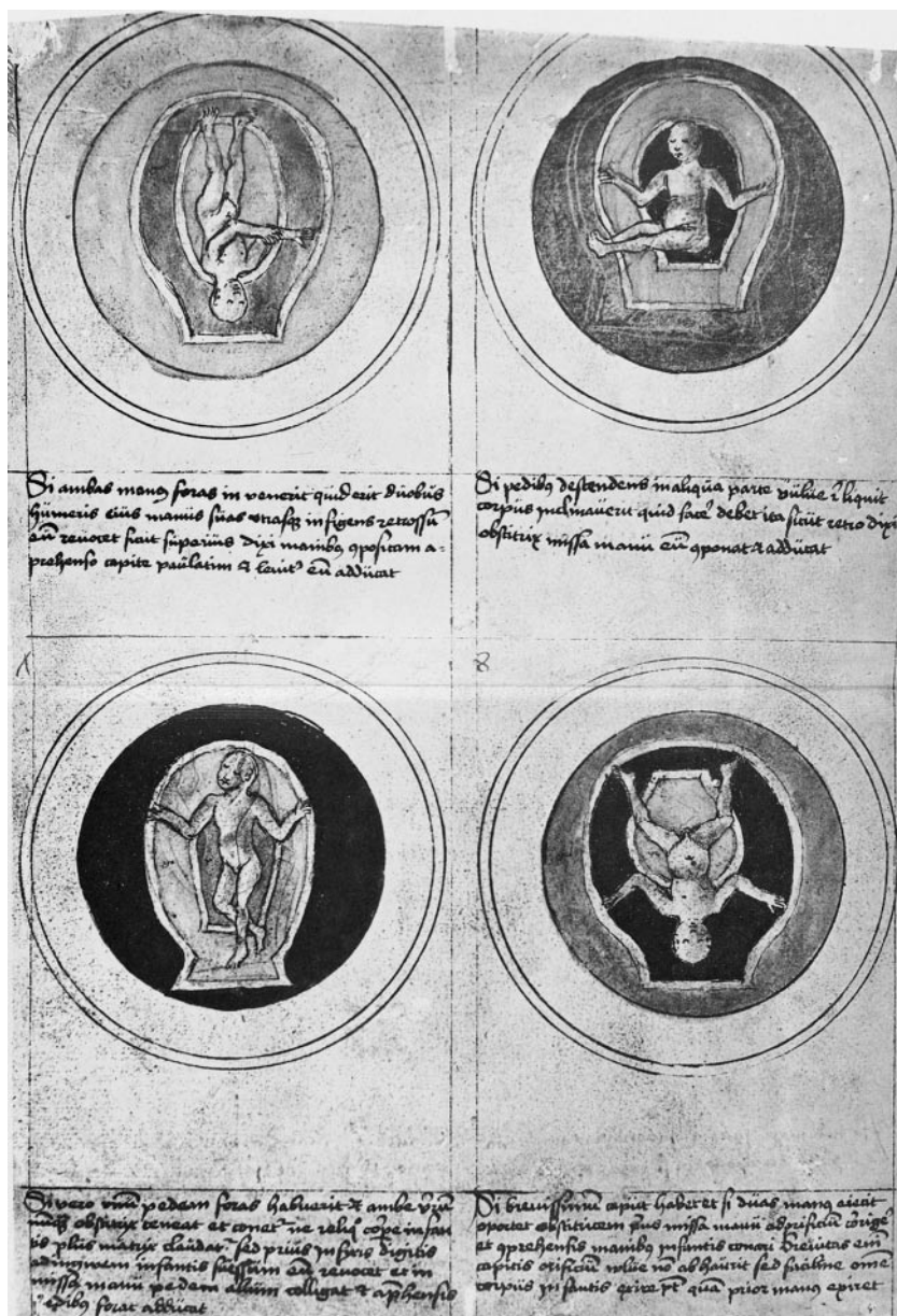
Figure 1: Figures 5–8 of the Muscian foetus-in-utero series from a manuscript produced in Bavaria/Swabia around 1485. The copyist has misplaced the image of the small-headed foetus (what should be Figure 6) into the lower right corner. München, Bayerische Staatsbibliothek, Cgm 597, f. 260v, reproduced from Karl Sudhoff, 'Neue Handschriftenbilder von Kindslagen', Archiv für Geschichte der Medizin , Jan. 1908, 1: 310–15, plate III.