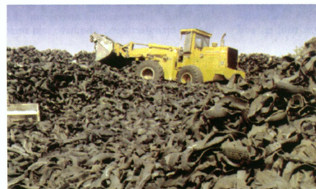
International Tire & Rubber Association