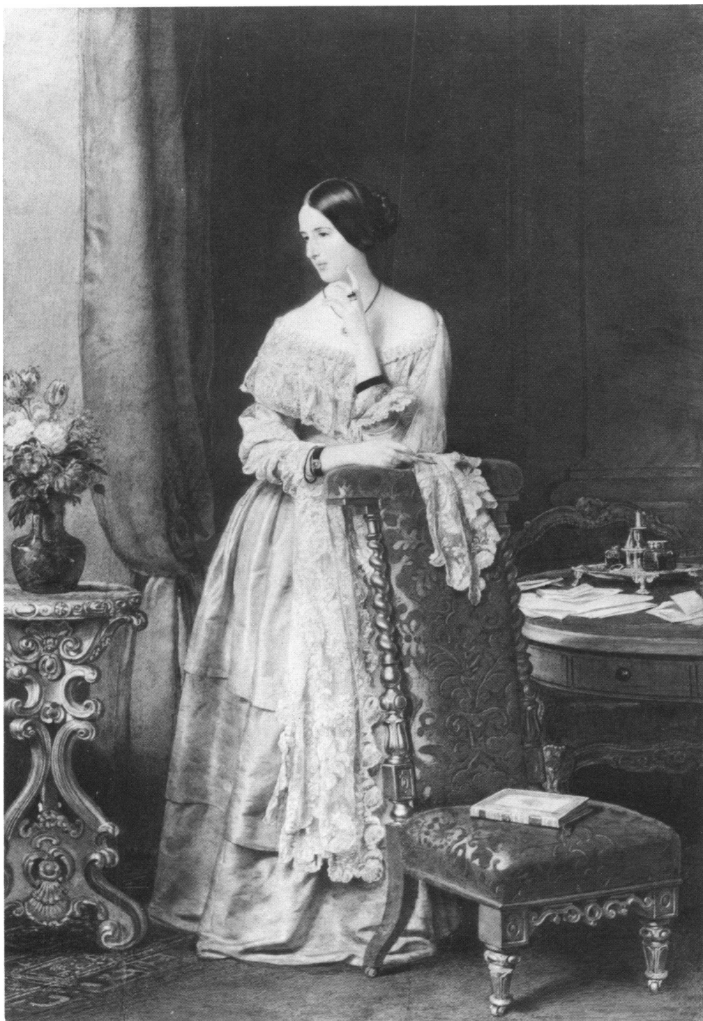
Figure 1. Baroness Burdett-Coutts, 1858. Watercolour upon ivory by W. C. Rose.