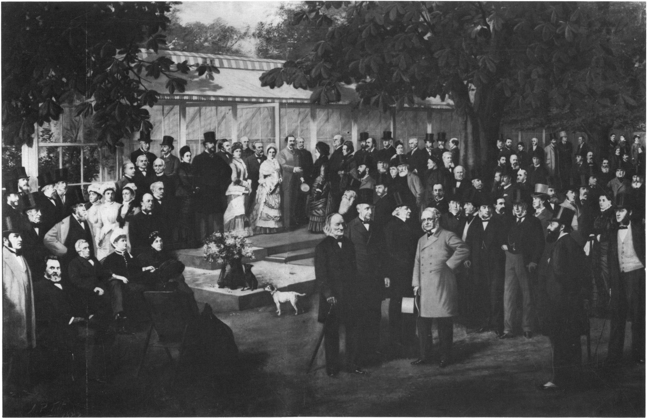
Figure 2. Baroness Burdett-Coutts' garden party, 1881. Artist: A. P. Tilt.