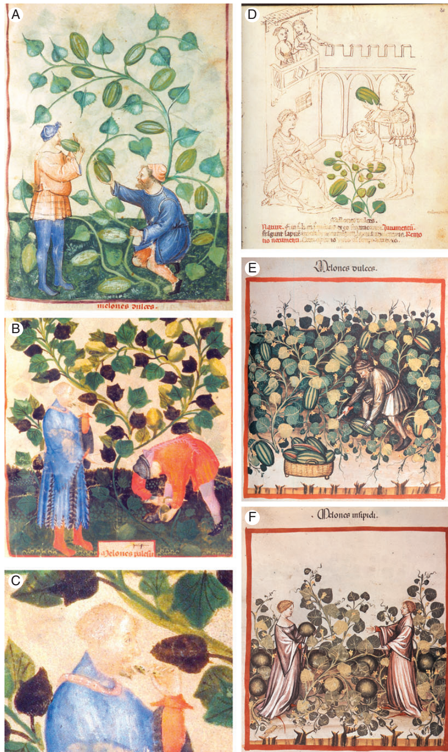
FIG. 2. Images of watermelon drawn from approx. 1385 to 1395. (A) Melones dulces of the Tacuinum sanitatis , Bibliothèque Nationale de France, ms. Nouv. Acq. Lat. 1673, fol. 37r. This image depicts elliptical fruits that are striated yellowish dark green; one that has been harvested is being sucked. (B) Melones palesini of the Tacuinum sanitatis , Bibliothèque Nationale de France, ms. Nouv. Acq. Lat. 1673, fol. 38r. This image depicts fruits that are rather small, short oval and light yellow-green. A cut piece of a fruit is about to be partaken. (C) Melones palesini of the Tacuinum sanitatis , Bibliothèque Nationale de France, ms. Nouv. Acq. Lat. 1673, fol. 38r. Magnification of the cut piece, showing its white flesh and black seeds. (D) Mellones dulces of the Tacuinum sanitatis , Bibliothèque de l'Université de Liège, Ms. 1041, folio 20r. The long oval fruits are striated dark yellow-green. (E) Melones dulces of the Tacuinum sanitatis , Österreichische Nationalbibliothek, Vienna, Cod. Ser. N. 2644, fol. 21r. The long oval fruits are light green distinctly and rather broadly striped dark green. Several of the fruits have split or been cut longitudinally to reveal red flesh. (F) Melones insipidi of the Tacuinum sanitatis , Österreichische Nationalbibliothek, Vienna, Cod. Ser. N. 2644, fol. 21v. The round fruits are plain dark green with a hint of yellowing.