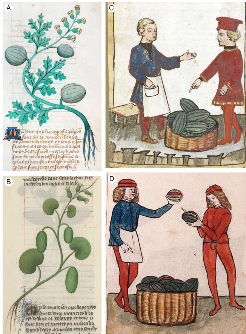
FIG. 4. Images of watermelon drawn from approx. 1430 to 1475. (A) Melons of the Livre des simples médecines , Kongelige Bibliotek (Copenhagen), ms. GKS MS 227 2°, fol. 152r. This image depicts a much simplified plant with fruits that are small, round to obovate, medium green with narrow darker stripes. (B) Melons of the Livre des simples médecines , Biblioteca Estense (Modena), ms. Estero 28 = \alpha . M. 5. 9, fol. 119v. This image depicts an overly simplified plant with fruits that are small, elliptical and plain medium-dark green. (C) Meloni of the Libro de componere herbe e fructi , Bibliothèque Nationale de France, ms. ital. 1108, fol. 56v. This image depicts watermelon fruits, in a basket, that are being offered for sale. The fruits appear to be fairly large, and are long oval, medium green with dark green stripes of intermediate breadth. (D) Meloni of De re medica , Österreichische Nationalbibliothek, Vienna, ms. 5264, fol. 82v. This image depicts watermelon fruits, in a large basket, that are being offered for sale, one held by a fruit seller and one by a prospective buyer. The fruits are slightly oval, dark green with distinct but rather narrow darker green stripes, and several are sliced to reveal red flesh.

Livre des Simples Médecines , 1430: Kongelige Bibliotek (Copenhagen), ms. GKS MS 227 2°