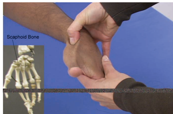
Figure 2. Palpation of body surface anatomy is shown in close up with use of split screen to correlate with skeletal body anatomy. Use of graphics and labels to help orient viewer.

M-OSCE were implemented and data were collected during the second year of medical school for both groups. The M-OSCE consisted of a shoulder impingement case. Trained standardized patients graded the M-OSCE for the experimental group, whereas an untrained third-party observer was used to grade the control group. A score sheet was used to grade the encounter and physical exam. This score sheet included a more precise set of grading instructions only for the standardized patients who graded the experimental group. Specifically the “checkbox” system (which was used for the control group) was changed to “bubbles” in order to deter graders from checking an intermediate answer. Also, a diagram was added to the score sheet demonstrating how to fill in the bubble correctly vs. incorrectly. Good inter-rater reliability for grading with the bubble system was demonstrated among the standardized patients, whereas inter-rater reliability was not assessed for the untrained third-party observers who